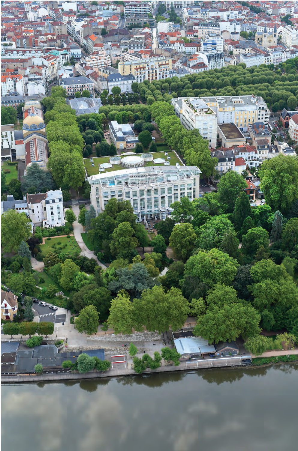
Célestins Spa Hôtel. Vichy