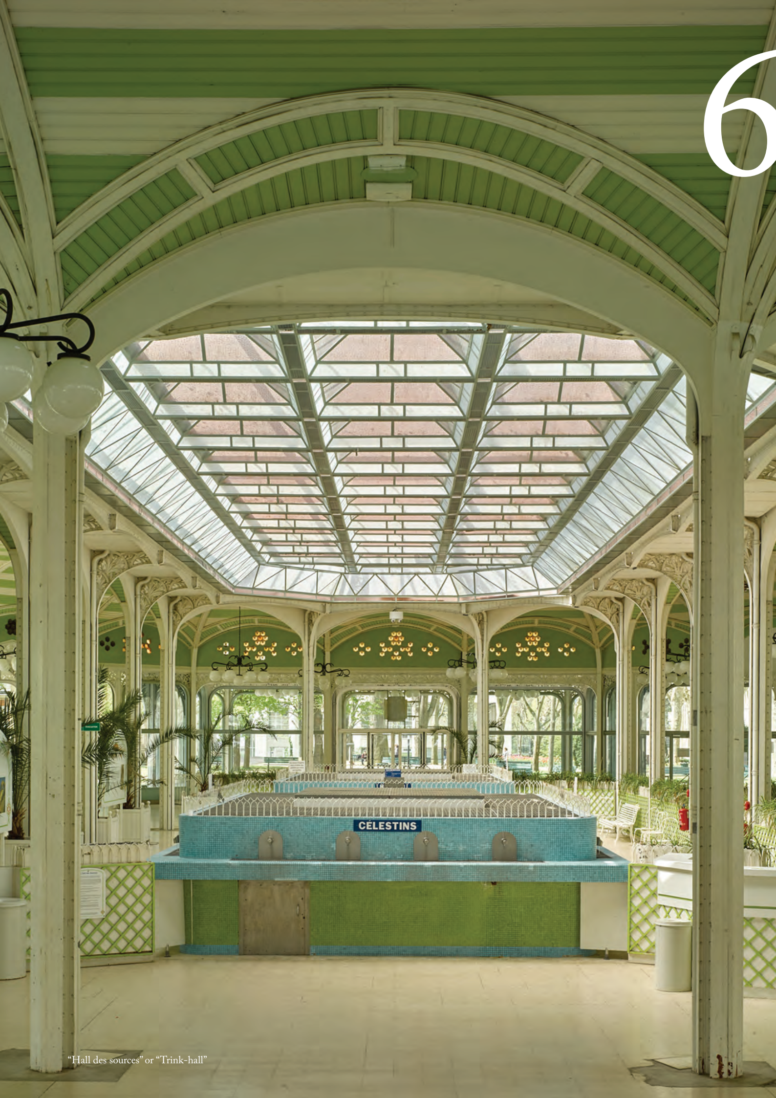
“Hall des sources” or “Trink-hall”