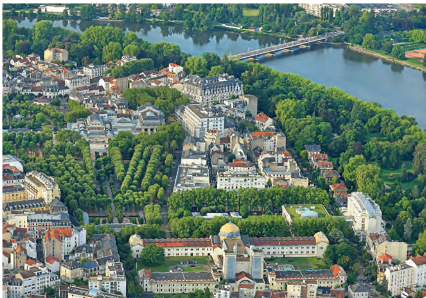
View south across the principal spa quarter to the River Allier